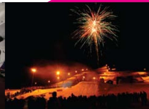
Left to right: Merry mirth in Méribel; Big fireworks at BUSC's Main Event