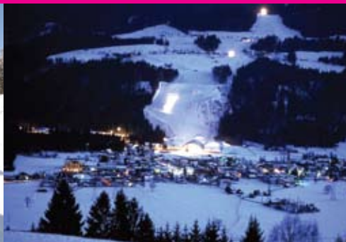
Left to right: Anything goes at Snowbombing; Nassfeld – the scene of Snowside

double figures this year, Fatboy Slim will be hitting the decks, alongside a hip-shakingly huge line-up, including Dizzee Rascal, Grandmaster Flash and Horse Meat Disco. Start stocking up on sleep now – there's not a minute of Snowbombing to be missed, with raving in the Arctic Disco at 2000ft, entering the Lumberjack Olympics and gawping at the pros in the Highway to Hell comp, not to mention maybe doing a run or two with your mates. Just smile and stick on a 'tash, you'll love it. When: 29 March – 04 April Where: Mayrhofen, Austria How: www.snowbombing.com