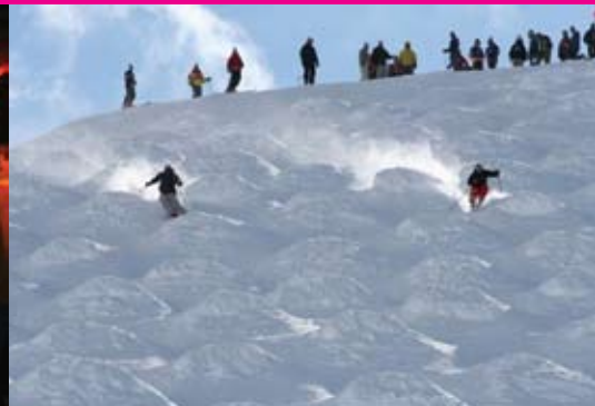
Left to right: Free fun at the Show Love Tour; Bouncing at the Brits; And at the Boss des Bosses

P artying in the Alps is always so much sweeter than at home. It's something to do with the endorphins rushing through your body from a day of action, the higher altitude, the fresher air and the possibility of the unknown coming together in a heady thrill that grabs you by the gut and demands attention.