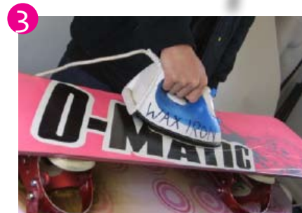
3 Iron out the creases in your board and smooth out the wax