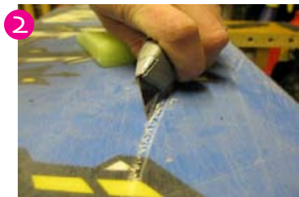
2 Cut off the rough innards with a Stanley knife