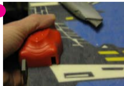
File guide and file will give good edge

To tune, you’ll need a file and a file guide. The handy little file guide holds your file at the specific angles needed for skiing or snowboarding, namely 88° or 90° (see the picture above right). As a general rule, use the 90° guide for those oh-too-rare powder days and the 88° guide for hard-packed conditions or racing. With long smooth strokes, file the edge and overlap each section to maintain a uniform line from tip to tail. If you’re unsure how much edge to remove, a good tip is to line the side edge with a marker pen then file until the ink is gone from the base. As you go along, wipe away the little shards of metal from your base to stop them being ground into your board. Finish your edge by gently