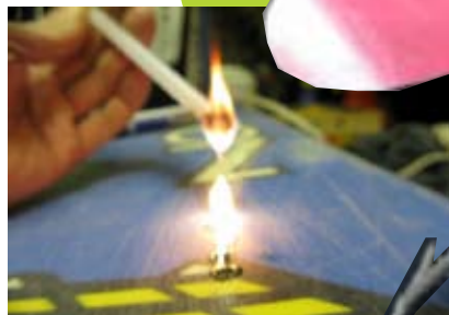
Burn P-Tex burn, and drip into holes

finish, remove the excess P-Tex with the scraper and sandpaper, so it's flush with the base of the board or skis.