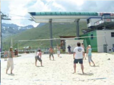
Far left: A short respite from competing Left: Settling scores on the volleyball court