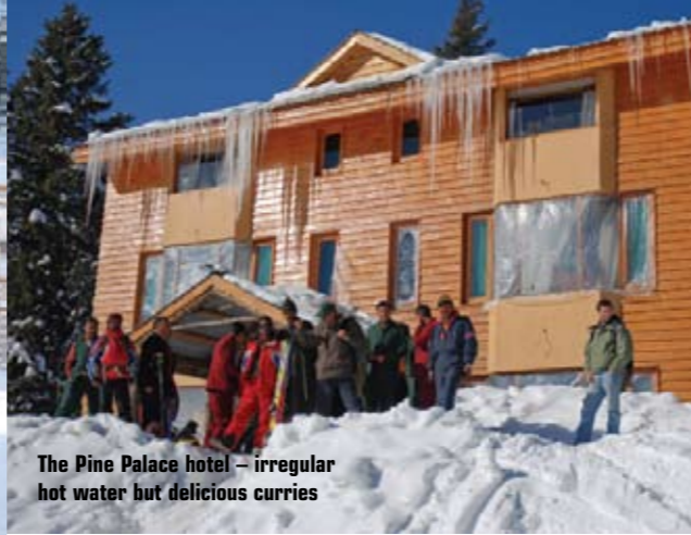
The Pine Palace hotel – irregular hot water but delicious curries