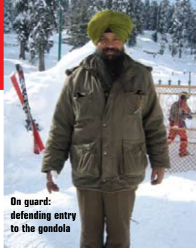
On guard: defending entry to the gondola

It's all about perception; despite active terrorist groups operating in Spain, few Brits would think twice about travelling there. Yet because Kashmir is a far away land in a distant realm, we fear it more greatly than perhaps we should.