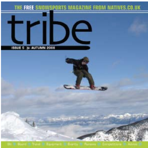
Rider: Glen Robitaille Location: Banff