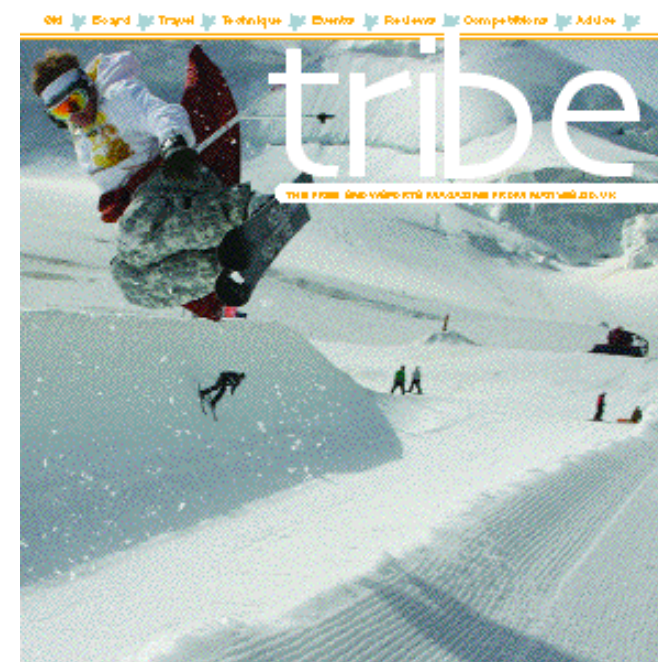
Rider: Pat Sharples. Location: Saas Fee.

The winning cover shot shows Ben McHugh jumping over Dan Mayo in Whistler's park in April 2006 (while Lorne was out of action with a torn thumb ligament).